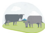
Animal Health & Welfare