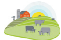
Efficiency & Innovation